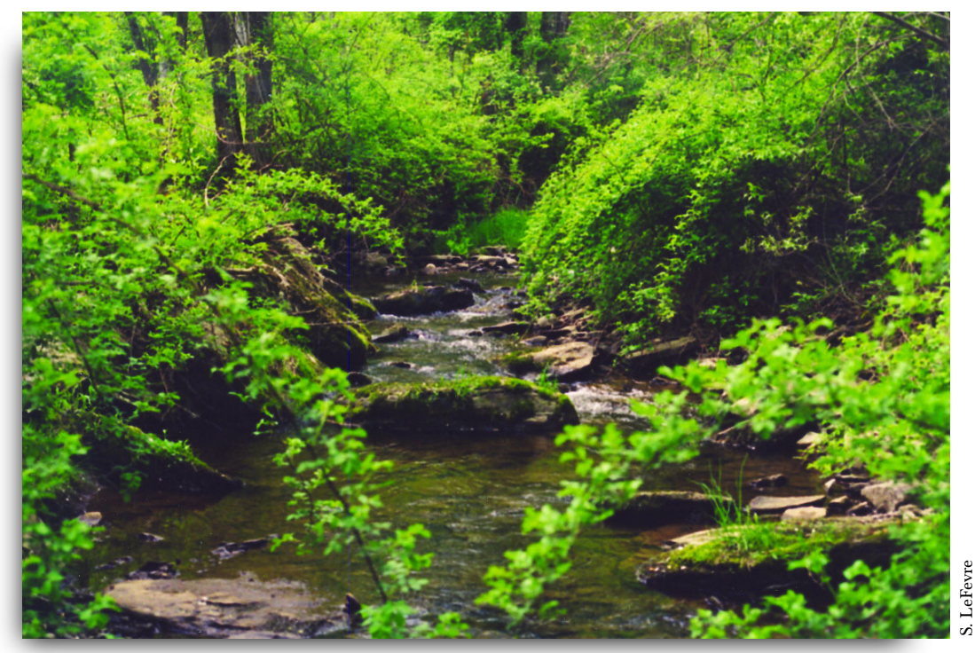
Stonestreet Creek near Birchardsville, Susquehanna County