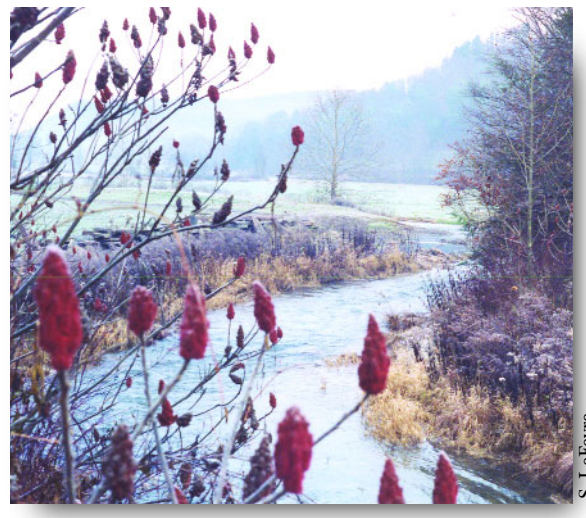
North Branch Wyalusing Creek north of Gaylord Creek, Susquehanna County

The Wyalusing Creek Watershed is located in Bradford and Susquehanna Counties in northeastern Pennsylvania and includes significant portions of Bridgewater, Forest Lake, Jessup, Middletown, Rush, Pike, Stevens, Herrick, and Wyalusing Townships (Figure 1).