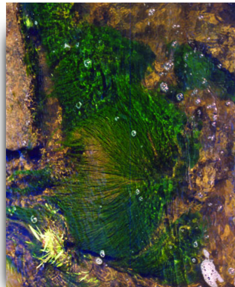
Algae in Pettis Creek west of Montrose, Susquehanna County

Biology was severely impaired at PETT 0.1 with the lowest taxonomic richness (15), percent Ephemeroptera (2.74 percent), and number of EPT taxa (5) of all the sites in the Wyalusing Creek Watershed. The site was highly dominated by midges (Chironomide) and water penny beetles ( Psephenus ). The habitat was rated excellent at the sampling site although vegetative cover and stream buffer width needed improvement. Algae were very thick and prevalent at this site.