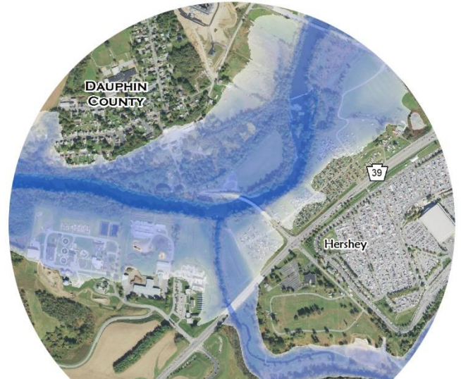
The map above shows the extent and depth of a flood resulting from stage 26.8' (record flood stage) at Hershey, PA.

River Flooding: The National Weather Service (NWS) issues river forecasts based on expected rainfall and river conditions in the watershed. Based on the forecast from NWS, you can view a map that most closely resembles the predicted extent of the flood.